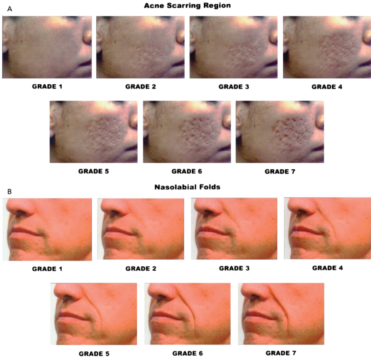
Figure 1. Standardized photoguides used for judging efficacy. (A) Acne scars. (B) Nasolabial lines. Patients were considered responders if there was a 2-point shift as determined by the investigator during a live examination.

The proportion of responders was dramatically higher in the Isolagen live fibroblast treatment group than in the placebo group throughout the controlled study (Figure 2). At 1-month follow-up, the responder rate among fibroblast-treated patients was 54.4% versus 30.8% with placebo. At 2 months, the fibroblast responder rate increased to 77.3%, whereas the placebo responder rate remained relatively the same at 34.3%. At 4 months, rates were 75.5% versus 34.3%, and at 6 months, 81.0% ver-